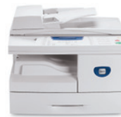
copy | print | scan | fax