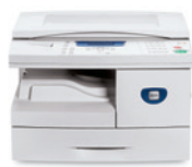
copy | print